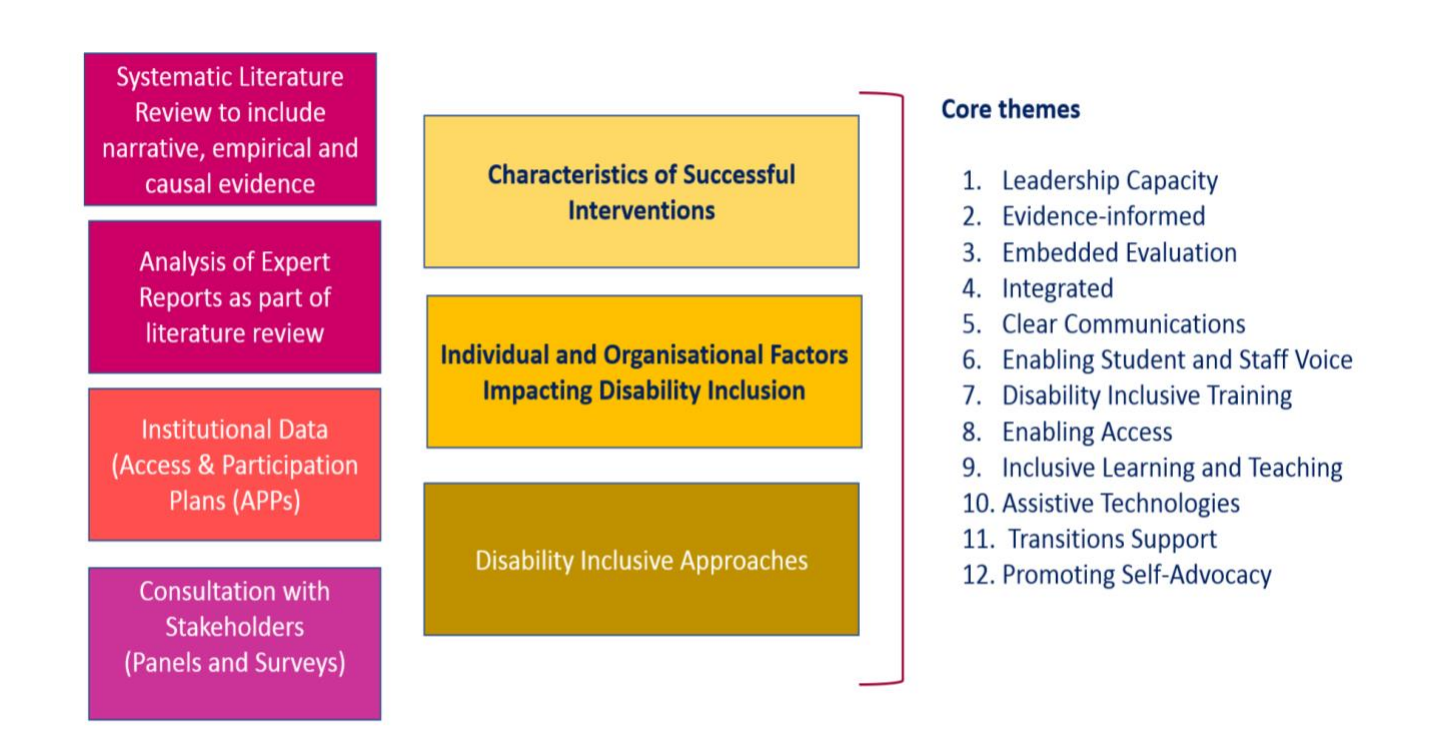
Figure 1: Rapid Evidence Review Components